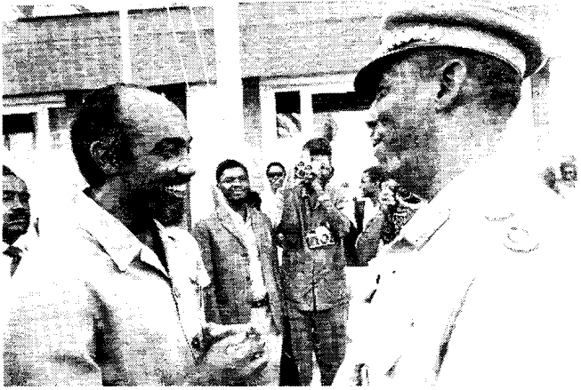
"All African countries and members of the OAU are our allies. Secondly in Africa all the freedom movements are also our allies."