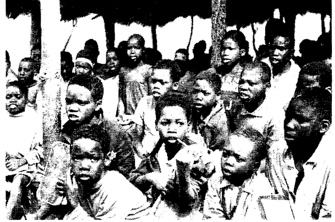
"Teachers of the negative school, they will serve to help the new generations who will not know what colonialism was to understand the definition of the enemy."