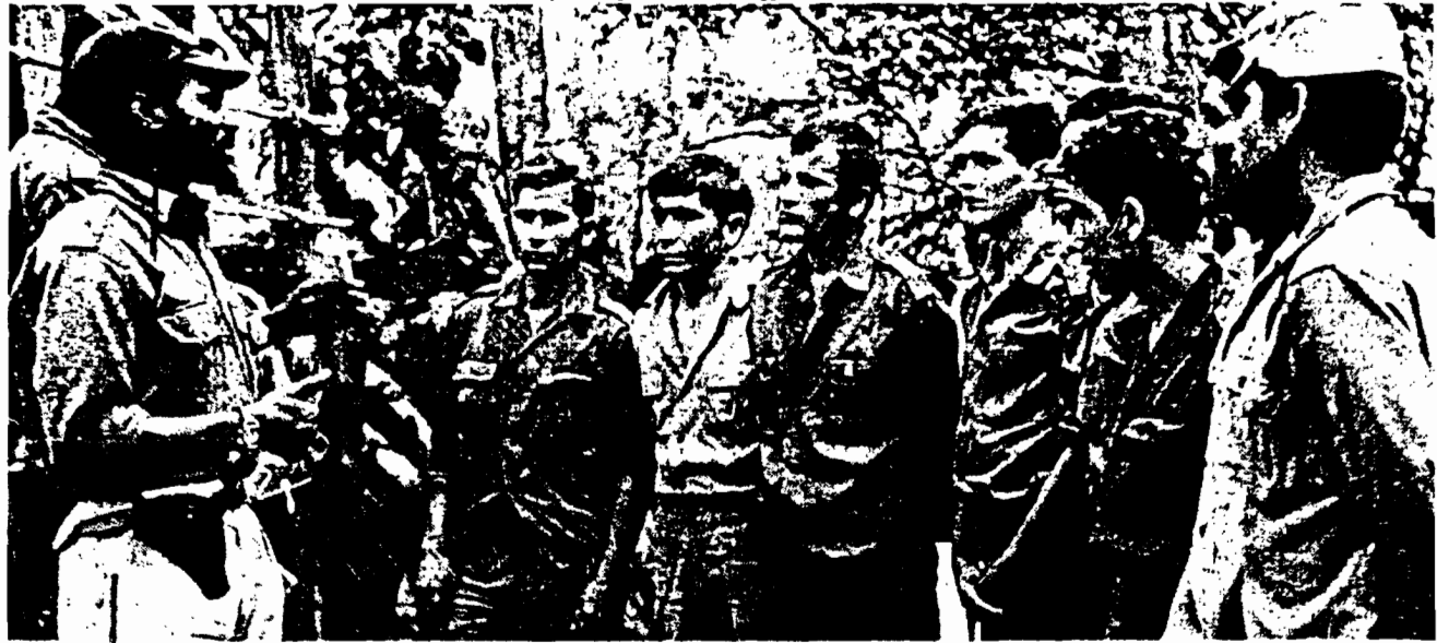
ANOTHER WAR, ANOTHER TIME . . . Machel the guerilla speaks to captured Portuguese soldiers during Frelimo's fight for independence. Now the MNR is fighting its guerilla war against Frelimo.