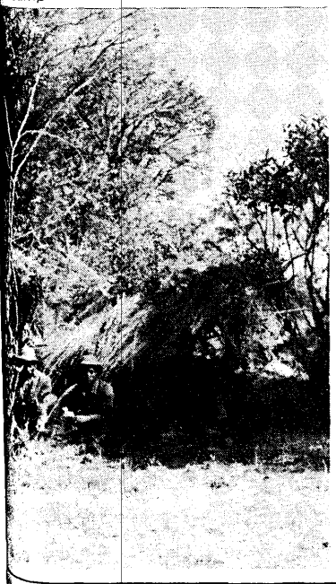
HE POINT 27 OCTOBER 1978

mewhere in Mozambique': a Resistance amp