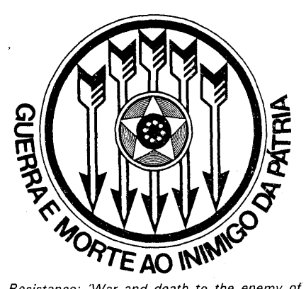
Resistance: 'War and death to the enemy of the Motherland'

bique — is that the Resistance forces now control vast areas of central Mozambique, extending from the coastal town of Beira to the Rhodesian border to the west and northwards to the crucial Tete province where the giant Cabora-Bassa dam is situated. Moreover, the communique lists actions as far north as Milange, near the Malawi border,